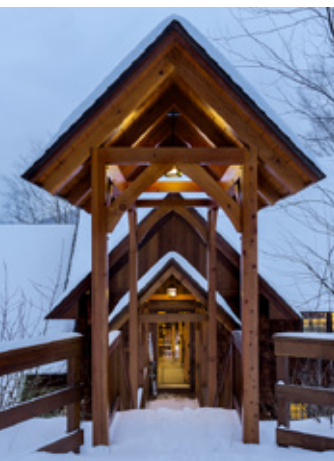
Above: Steeply pitched roof lines convey the idea of a chalet and are immensely practical in an area with heavy snow fall.